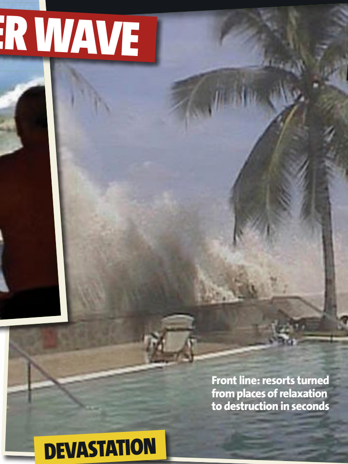
Front line: resorts turned from places of relaxation to destruction in seconds